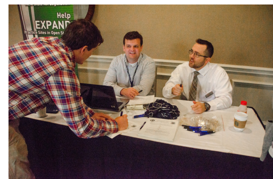
An AAAA member donates to the legislative fund at the Annual Conference