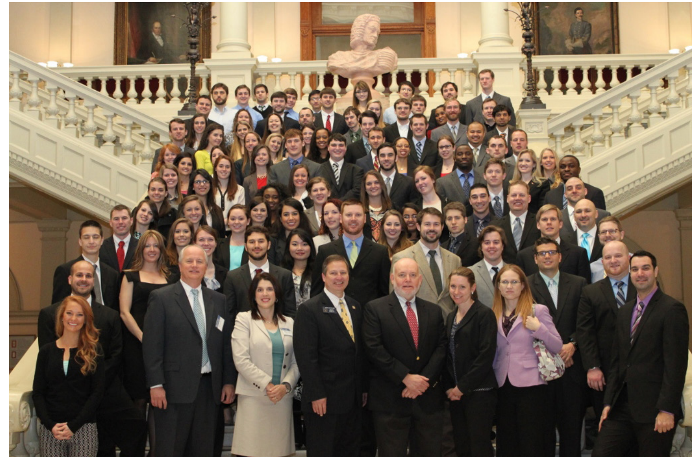
(Atlanta) – More than 100 AA Fellows and Students participated in the several activities of the GAAA’s 1st Annual AA Day at the Capitol. Legislators enjoyed a homemade biscuit breakfast and the opportunity to meet AAs from their districts who are in practice or in training.