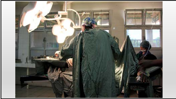
CHALLENGE: INVISIBLE END USERS