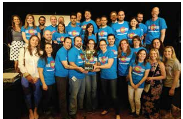
2016 Annual Meeting, UC Denver wins Student Component Cup competition

Good advice: Dress appropriately as a career opportunity might occur at any moment. Stock up on a caffeine source and be prepared for a busy day interacting with anesthesia professionals from around the country. There will be physicians and practice management groups present who want to interact with future anesthesia providers. Always have a resume or business cards and a pen handy. And most importantly, be ready to win the AAAA Cup!!